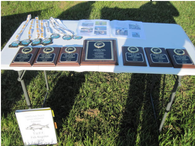
2012 TUFF Youth Fishing Medals and Adult 1 st and 2 nd Place Plaques