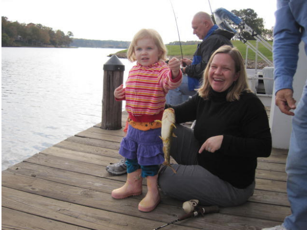
Official 2012 TUFF Derby Scoreboard:

of Hidden Lake reeled in a one pound catfish during the October KCC Fish for Fun at the Country Club Marina dock, while also displaying some great fishing fashion sense!